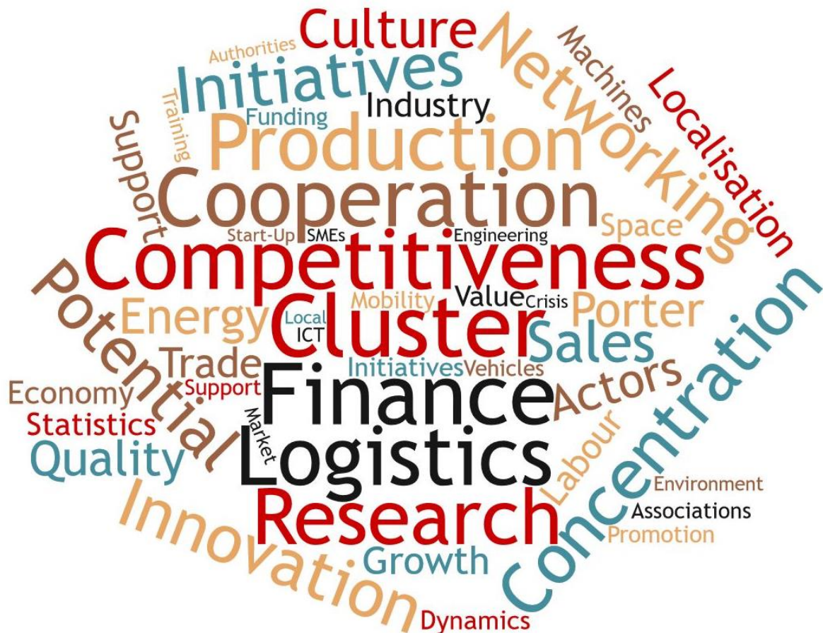
Fig. 2: Word cloud based on the Cluster study

Schroth O, Pond E & Sheppard SRJ (2015) Evaluating presentation formats of local climate change in community planning with regard to process and outcomes.